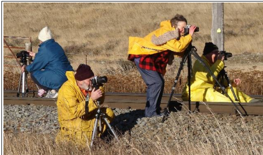
Yellowcoatus sp. photographii by Judy Reij, Cass Area

We had a wonderful time, with a positive cornucopia of photographic light and, mostly, an abundance of excellent weather. We stayed in the Backpackers Lodge at Flock Hill Station, which is only one paddock away from Lake Pearson, so we were able to go to the northern end of the lake each morning to immortalize the dawning of the day. All persons were seemingly happy to set alarm clocks for 5.45 a.m. and be ready, dressed, showered, breakfasted and in cars before 7.00 a.m.- and then we were off to the lake.