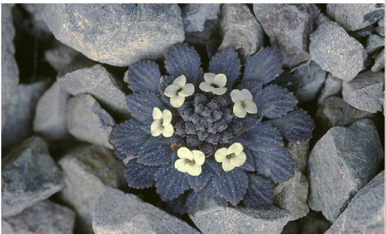
Penwiper Plant (Notothlaspi rosulatum) by Dawn Radcliffe-Taylor, Honours in 1st Natural History Projected Images