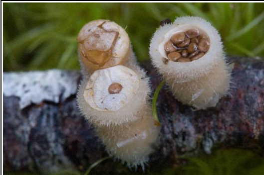
Birdsnest Fungi, Lewis Pass Area

At least I thought they were keen, but it turned out that some of them were expecting the tearooms to be open so that they could buy an early coffee. Tough luck people! The tearooms were still not open when we left at 8.00 a.m.