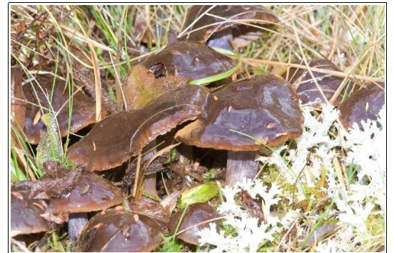
The "Yuk! What is it? Fungi". Lewis Pass Area by Dave Gibb

PS : the weather forecast was for very heavy rain for 24 hours from 6.00 a. m. on the day to 6.00 a. m. on Monday - Oh Good - THEY got it wrong AGAIN III