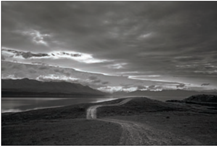
Lake Pukaki