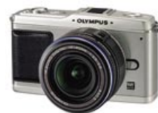
Olympus E-P1

One of the more eagerly anticipated arrivals has been the Olympus E-P1. A modern interpretation of the original 60's Olympus Pen F half-frame cameras, they offer a unique combination of interchangeable lenses, and a big sensor just like an SLR all wrapped up