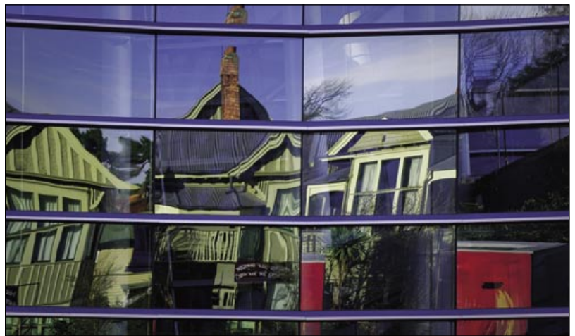
above right: Reflecting on a great day, Carol Campbell below: Untitled, Carol Campbell

Do feel welcome to become involved; details of activities will be on the CPS website: www.cpsnz.com