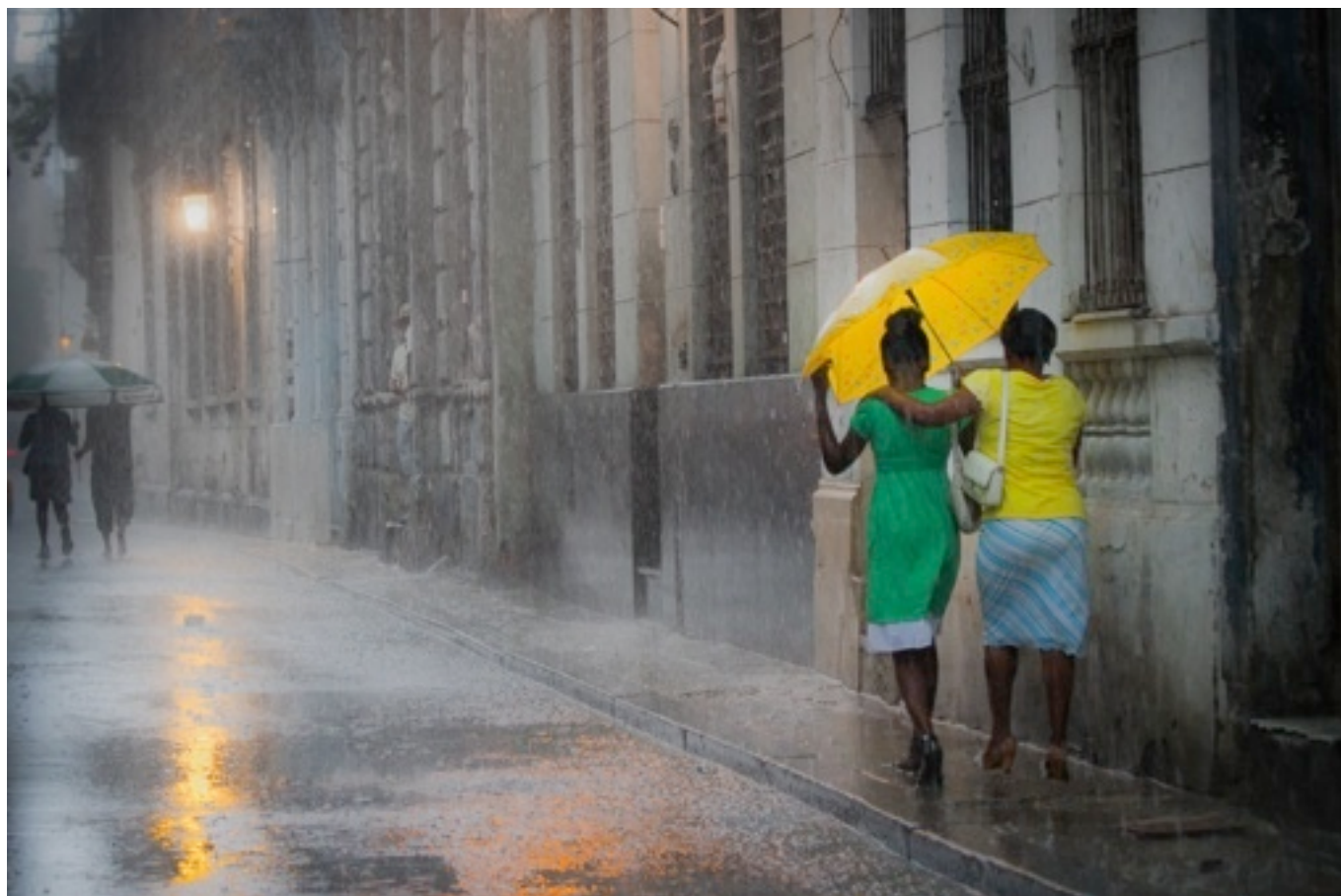
The Yellow Umbrella by Paul Willyams. PSA Bronze Medal at the Finland International Digital Circuit, Honours at the Southern Regional Convention, Acceptance in PI#10.